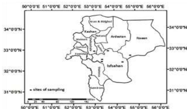
Figure 1- The study area and location of the sewage treatment plants from which the samples were obtained (12).